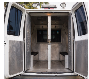
Prisoner Transportation Operations