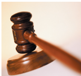
Non-Secure Residential Facilities